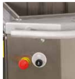
Protection / movement handle