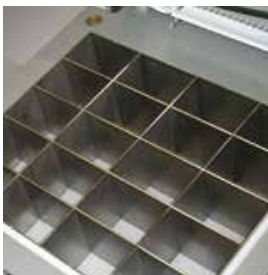
Stainless steel tank and knives