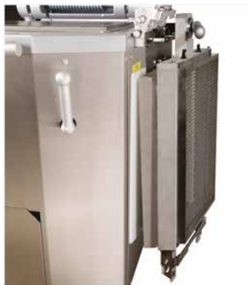
Right side grid and frame storage