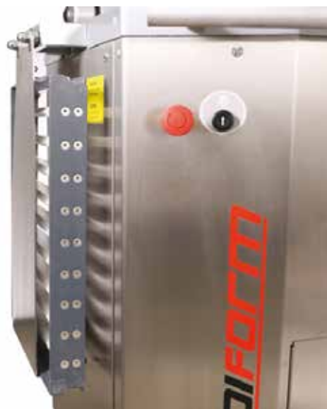
Left side grid storage