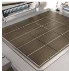
Easy Clean treatment of the cast iron head