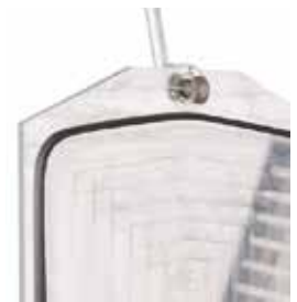
Flour splash prevention system