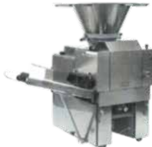
Divider Parta U