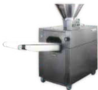
Divider Parta SN