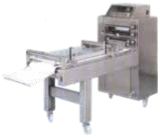
Long Moulding Machine BM51 series