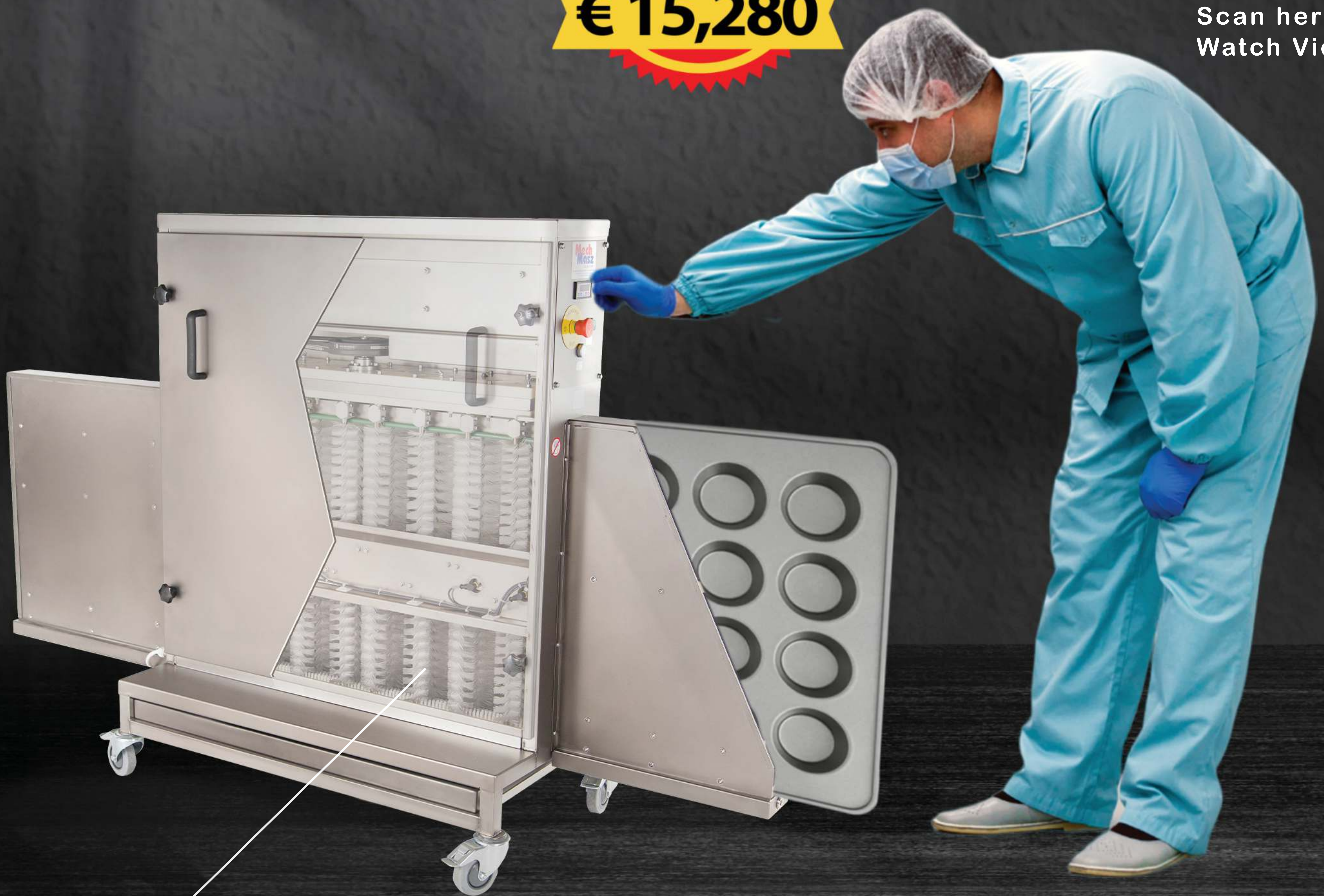
Strong technical brush