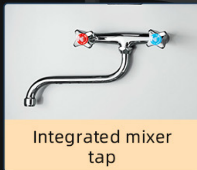
Integrated mixer tap