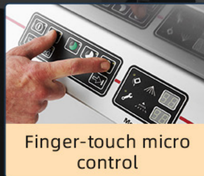
Finger-touch micro control