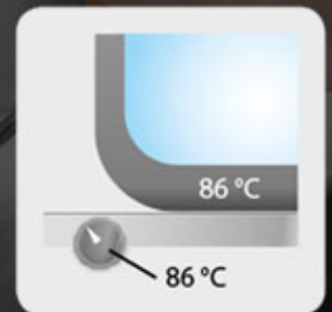
Induction with RTCSmp