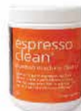
CAFETTO CLEANING POWDER