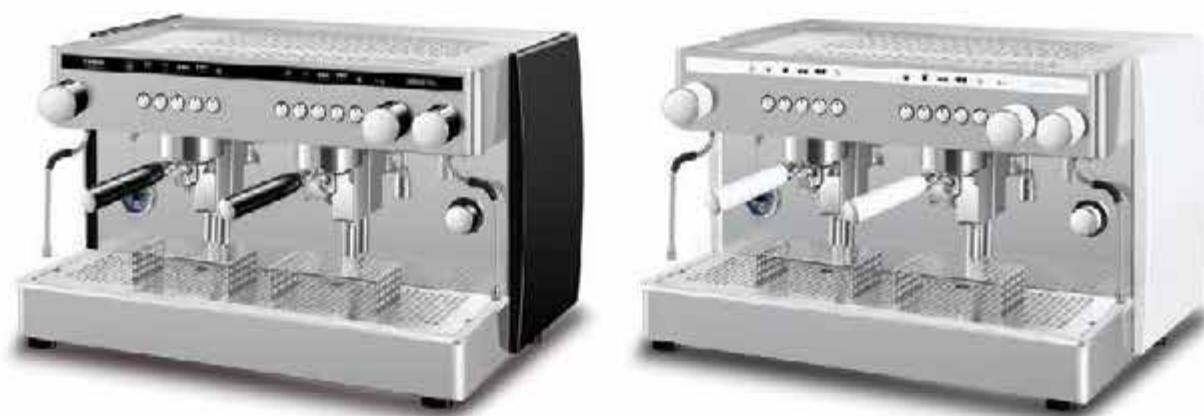
Saeco - Perfetta 2 Groups