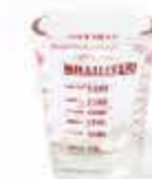
ESPRESSO SHOT GLASS Material Glass Capacity ml / oz / teaspoon / tablespoon