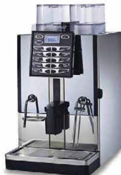
Nuova Simonelli - Talento