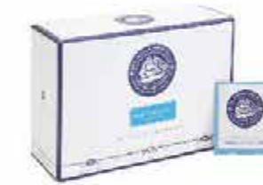
ENGLISH BREAKFAST 30pcs x 2g 100pcs x 2g