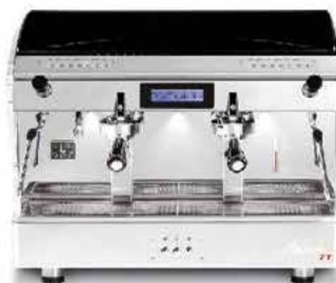
Master Etnica Display TT