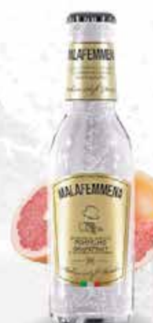
Grapefruit Soft Drink 200 ml