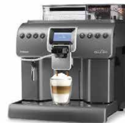
Saeco - Aulika Focus