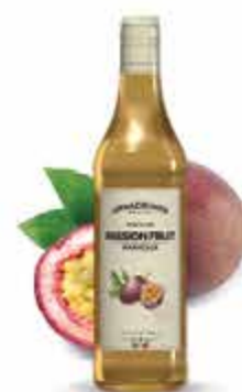
Passion Fruit Syrup Line 750ml