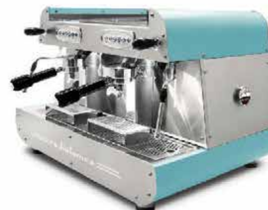
Orchestrale - Radiofonica