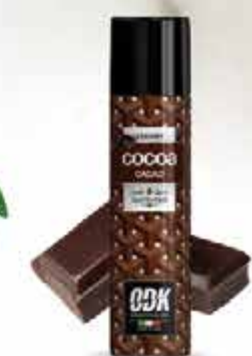
Cocoa Creamy Line 1kg