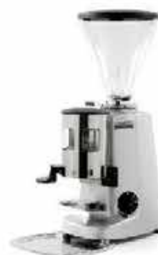
Mazzer Super Jolly Manual