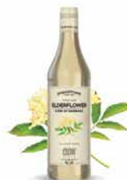
Elderflower Syrup Line 750ml