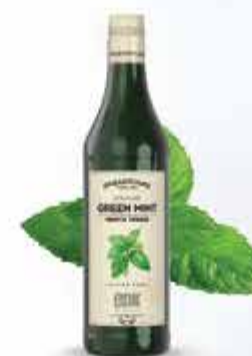
Green Mint Syrup Line 750ml