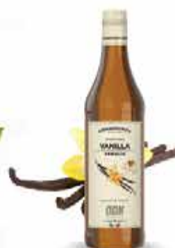
Vanilla Syrup Line / Barista 750ml