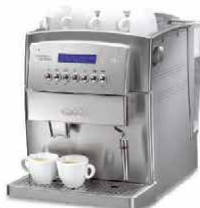
Gaggia - Titanium