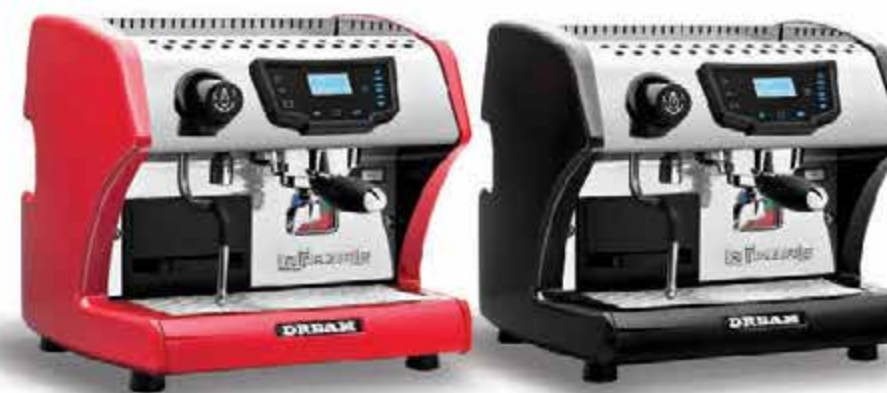
La Spaziale S1 Dream

Suitable for : Coffee Shop Fine Dining Restaurant Bar