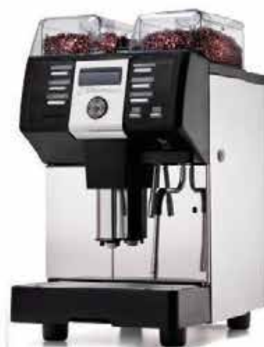
Nuova Simonelli - Prontobar Silent