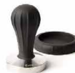
CAFELAT COFFEE TAMPER Material Rubber or Wood & Stainless steel Base Size 53mm or 58mm; Flat or Convex