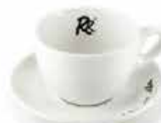
REGULAR Ø 85mm 210ml / 7oz