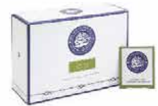
GREEN TEA 30pcs x 2g 100pcs x 2g