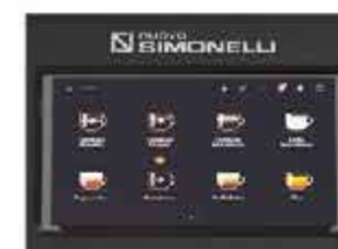
Touch screen display.

Suitable for : High Usage Office Coffee Shop Bakery Chain Restaurant Hotel