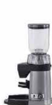
Casadio Deko Mini Grinder