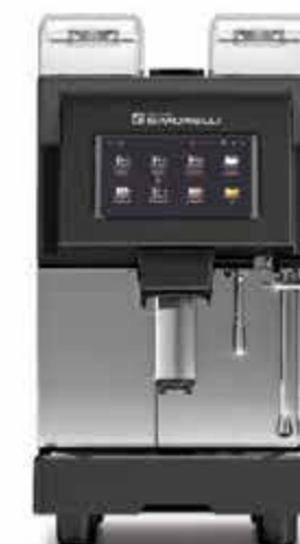
Nuova Simonelli - Prontobar Touch