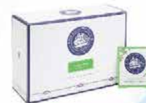
PEPPERMINT 30pcs x 2g 100pcs x 2g