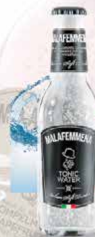
Tonic Water Soft Drink 200 ml