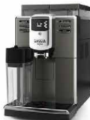
Gaggia - Anima XL