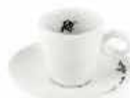
ESPRESSO Ø 52mm 75ml / 2.5oz