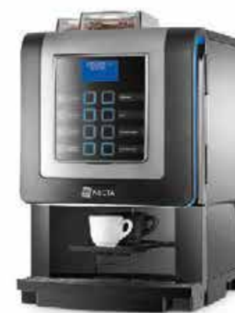
Necta - Koro Prime