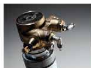
More stable and more silent.