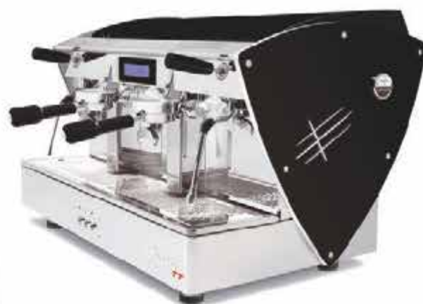
Orchestrale - Etnica Display TT