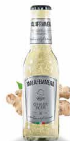
Ginger Beer Soft Drink 200 ml

Made fresh with natural spring water source from Cottian Alpines, the highest peak in Italy close to the French border