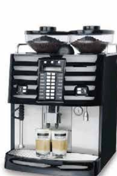
Schaerer - Coffee Art