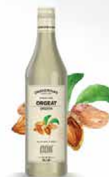
Orgeat Syrup Line 750ml