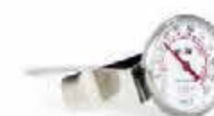
E&W THERMOMETER Material Stainless steel construction and plastic leans with stainless steel clip Temperature range -10°C to 100°C