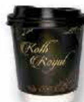
DOUBLE WALL PAPER CUP WITH LID Ø 75mm 240ml / 8oz