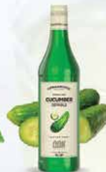
Cucumber Syrup Line 750ml