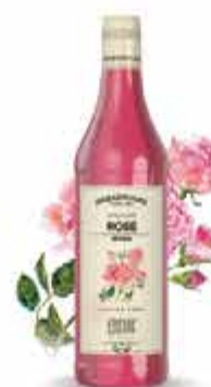
Rose Syrup Line 750ml