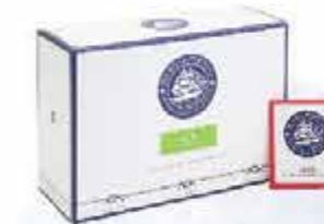
APPLE 100pcs x 2g