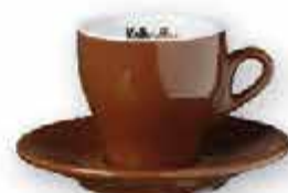
LATTE Ø 70mm 180ml / 6oz