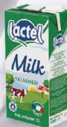
Skimmed Milk 1L