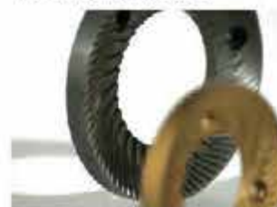
Professional grinding thanks to Nanotech grinders.