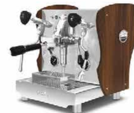
Orchestrale - Nota

* Color: Nut Wood / White / Black / Rust Brown / Light Blue Retro