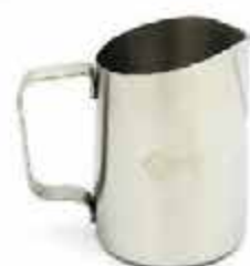
WPM MILK PITCHER Material Stainless steel Capacity 450ml & 650ml Spout Round or Sharp