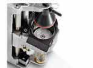
Metal and thermo-compensated delivery group.