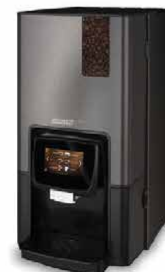
Bravilor Bonamat - Sego