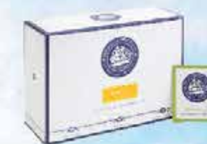
JASMINE 30pcs x 2g 100pcs x 2g