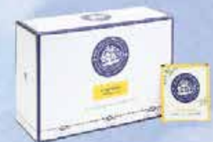
CHAMOMILE 30pcs x 2g 100pcs x 2g