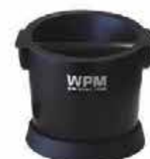
WPM KNOCKBOX Material Rubber Capacity Around 15 ground coffee cakes