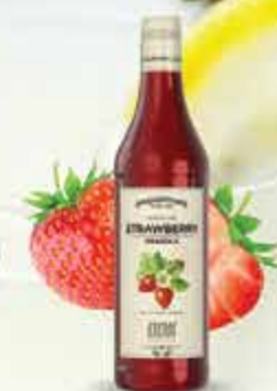
Strawberry Syrup Line 750ml