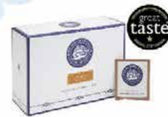
EARL GREY 30pcs x 2g 100pcs x 2g