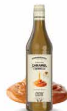
Caramel Syrup Line / Barista 750ml