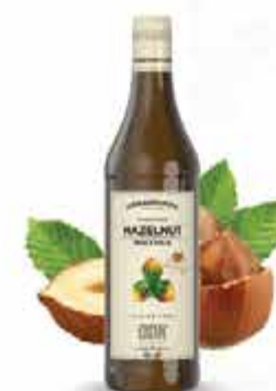
Hazelnut Syrup Line / Barista 750ml