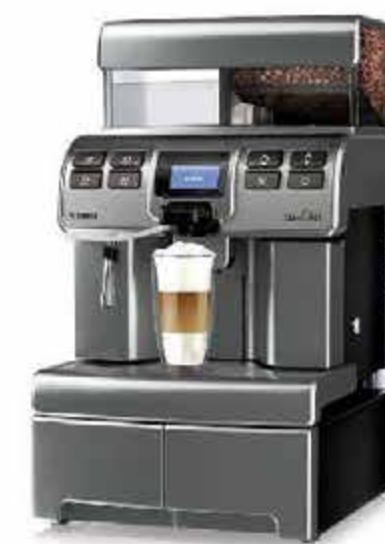
Saeco - Aulika Top