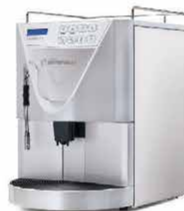
Nuova Simonelli - Microbar II *Color: White / Red / Black