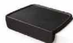
CAFELAT TAMPING MAT Material Silicon Rubber Size 210mm (w) x 145mm (D) x overhang 4mm