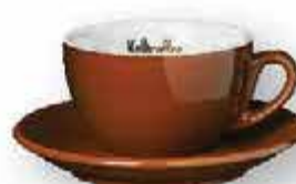
REGULAR Ø 85mm 210ml / 7oz