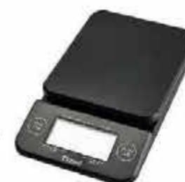
TIAMO DRIP SCALE Maximum capacity 0 - 3000g Additional Integrated Timer