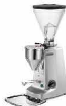
Mazzer Super Jolly Electronic