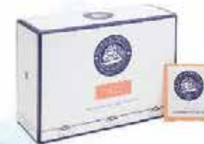
PEACH 30pcs x 2g 100pcs x 2g