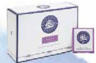
DARJEELING 30pcs x 2g