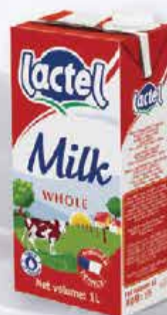
Whole Milk 1L

With strong positions in France thanks to product innovations such as low lactose and growing up milk for toddler, Lactel is today a leading milk brand in France enjoyed everyday by millions of consumers.