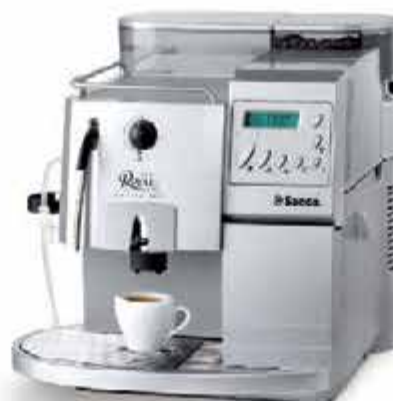
Saeco - Royal Coffee Bar