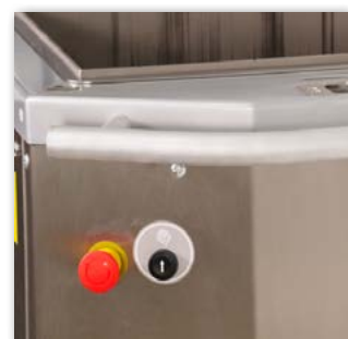
Protection / movement handle