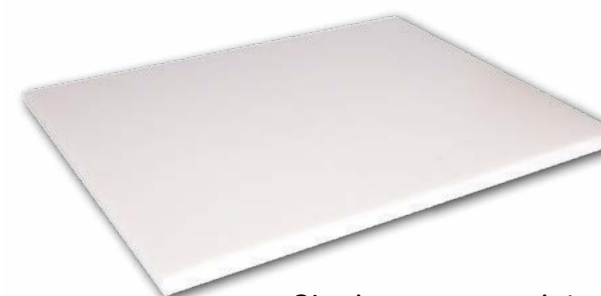
Single pressure plate