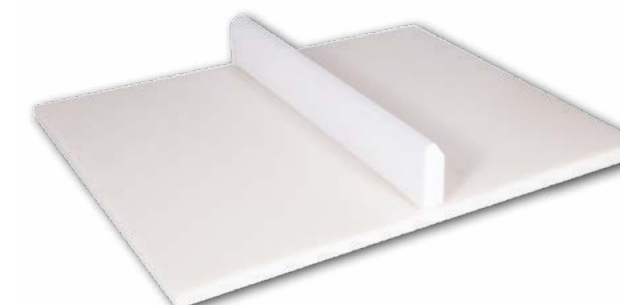
Half-grid pressure plate