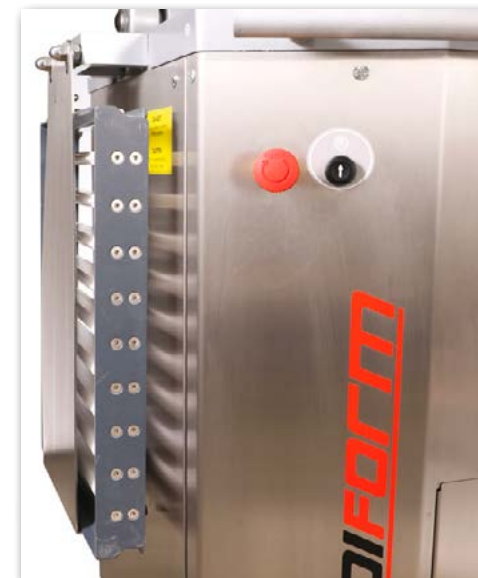
Left side grid storage