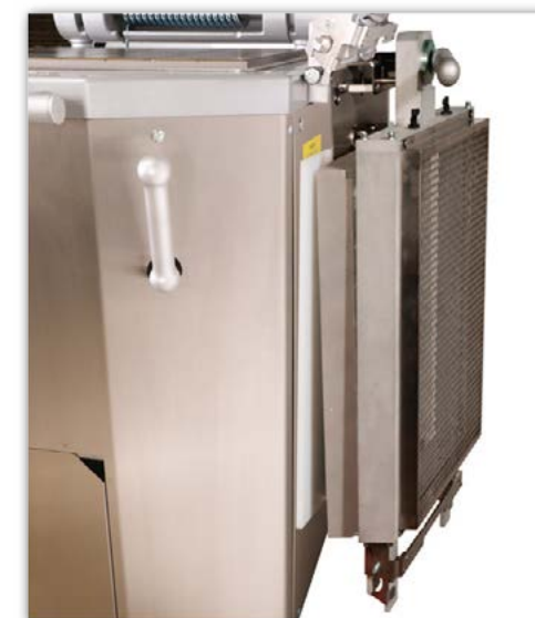
Right side grid and frame storage