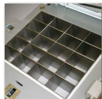
Stainless steel tank and knives