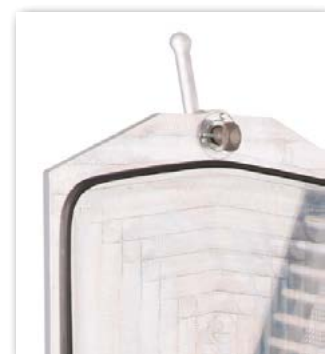
Flour splash prevention system