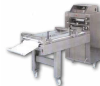
Long Moulding Machine BM51 series