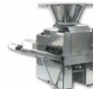
Divider Parta U