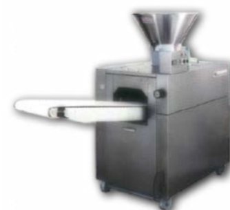
Divider Parta SN