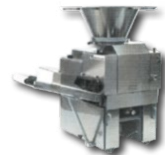
Divider Parta U