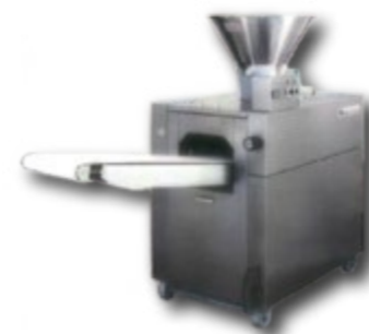
Divider Parta SN