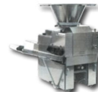
Divider Parta U