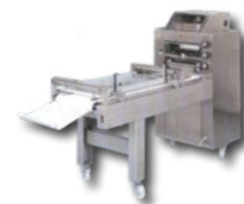
Long Moulding Machine BM51 series